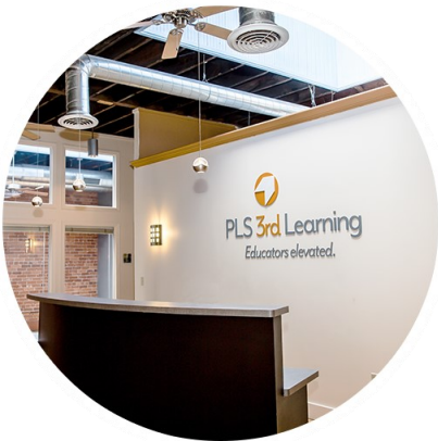
PLS 3rd Learning/ Super Eval is based in Buffalo, New York.