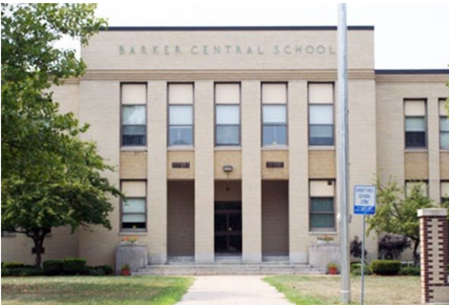
Top: Picture of Solar Liberty installation at Fredonia State College in Chautauqua County. Above: Barker Central School is one of more recent schools working with Solar Liberty.