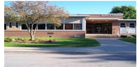
Top: Solar Liberty installation in the town of Holland. Above : Marilla Primary in the Iroquois CSD will be the newest project in WNY to have solar power thanks in part to the passage of a capital project in the district.